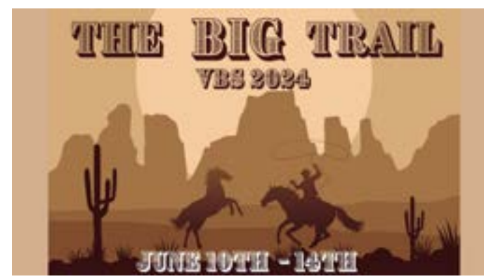
VBS MEETING NEXT SUNDAY FOLLOWING THE 10:30 SERVICE IN THE FLC!